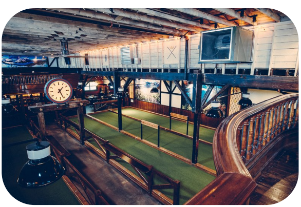
Rhein Haus - Seattle, Washington

Taking a road trip and want to keep up your game? The popularity of bocce is growing across the US, and the places below are just a few of the great locations that are built around our favorite past time!